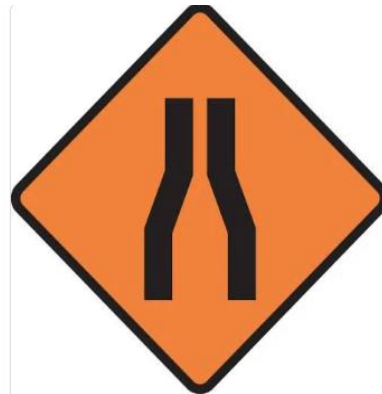
Lane Narrowing Sign - Level 1